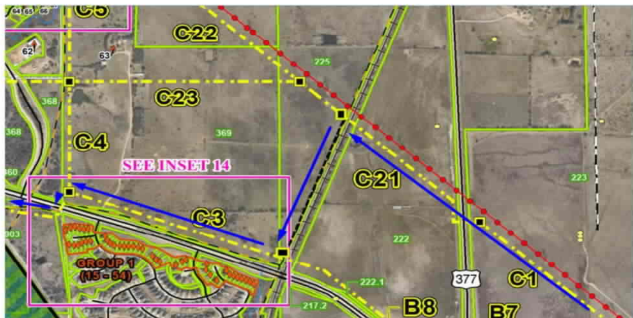
Map 1 - Links C21 to C3

Support: This testimony's purpose is to provide support and agreement from discussions held during the 8/17/2023 In-Person Settlement Conference. During this conference, La Estancia Investments, Furst Ranch, and additional Interveners discussed and agreed upon an alternative route that would best benefit the community and properties impacted by the ONCOR and PUC line selection. This alternative route (Map 1) comprises of Link C21 terminating at the railroad tracks, traveling south along the railroad tracks, and then connecting to C3, C6, and E6.