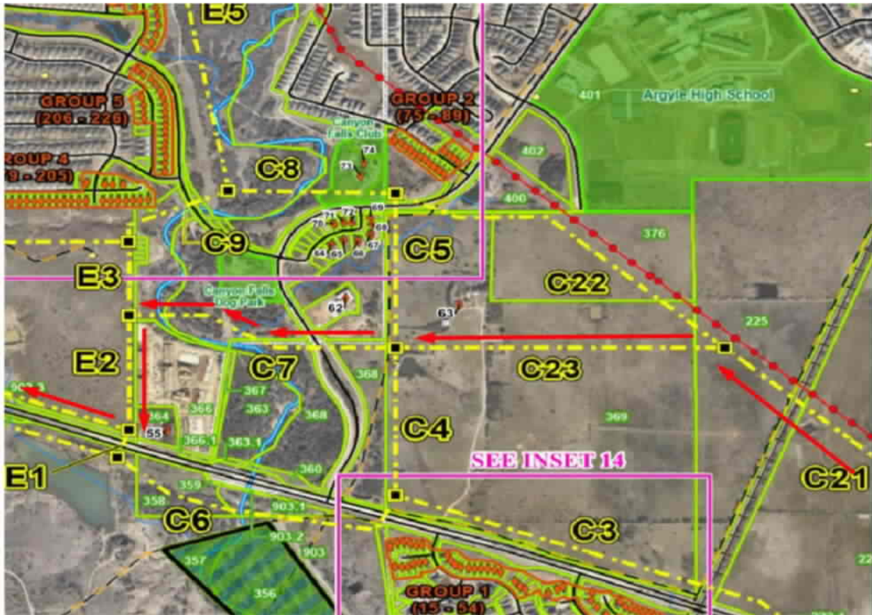
Map 2 - C21 to C23 to C7 to E2

PUC and ONCOR Route Selection 179: The route agreement between La Estancia Investments, Furst Ranch, and additional Interveners does differ from the route and links presented and supported by ONCOR and PUC personnel. The route and links that both ONCOR and the PUC personnel have suggested utilizes C21 to C23 to C7 to E2 (Map 2).