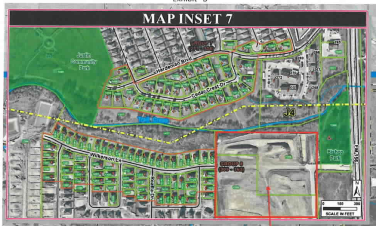
Justin Town Square Project