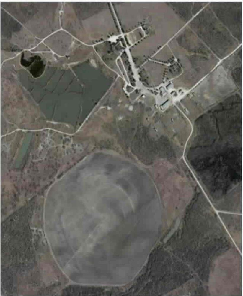
74 Ranch Resort Headquarters