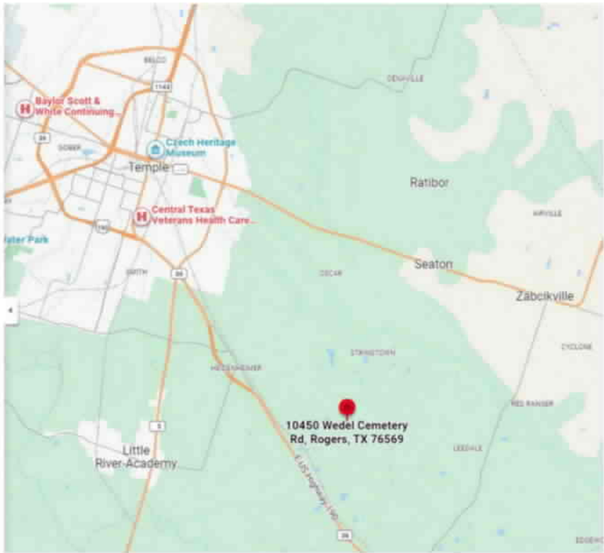
Figure 1: Project Site Map

This document shall be reviewed on an annual basis to ensure the integrity and safety.