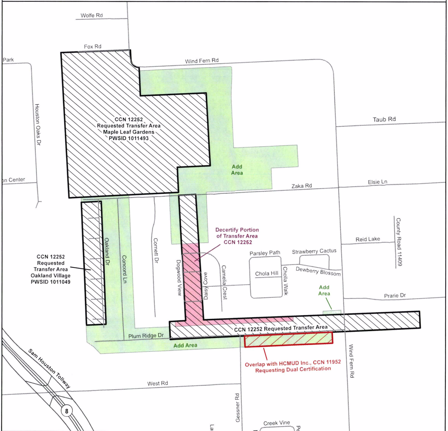
Detail Map - Maple Leaf and Oakland Village in Harris County