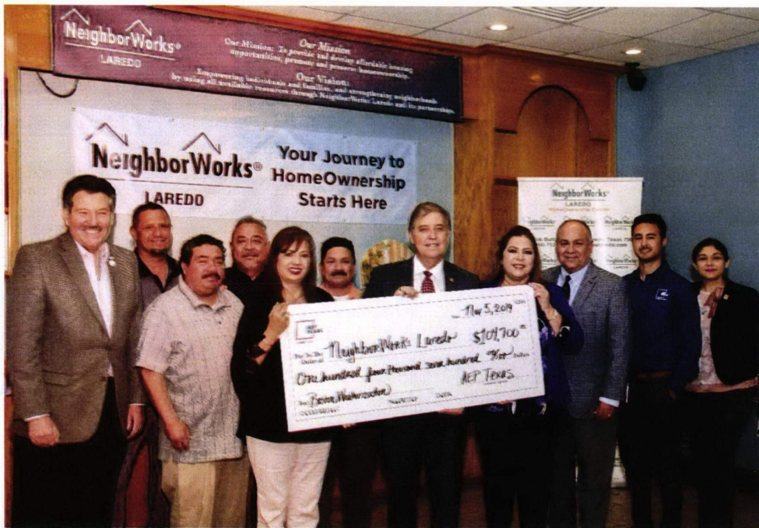
AEP Texas presented Neighborhood Works Laredo with a check for $104,700 as part of the Targeted Low-Income Program.