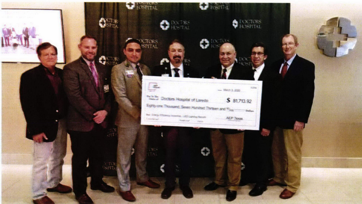
AEP Texas presented an energy efficiency incentive to Doctors Hospital of Laredo to replace lighting as part of the Commercial Standard Offer Program.