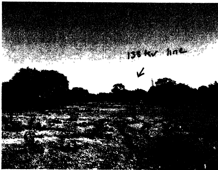
Figure 1. View of the 138 kv right-of-way from the ancestral Kettner home.